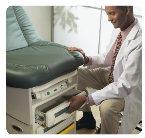
Ultra-Premium™ Top option is more comfortable for your patients, gives your practice an exclusive feel and elevates your reputation.

The new look of your exam room will also improve the overall impact of your office environment through the 604's stylized look featuring a onepiece upholstered top. The 604 not only looks great... but is also simple to clean. In addition, the 604 is user-friendly as its pneumatic cylinder assists in easily placing the counterbalanced top in an infinite number of positions. Release handles on both sides of the top section make positioning easy.