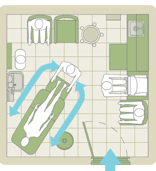
Optimal exam room size (10' x 10') and physician's flow